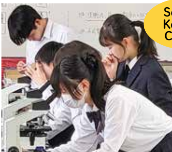
Science Koshien Contest