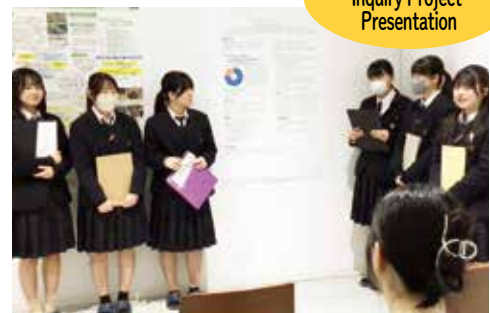
Tottori Prefectural Inquiry Project Presentation