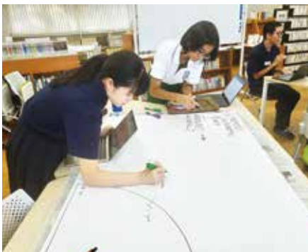
Online Interaction with St Joseph's Institution International School (Singapore) Students