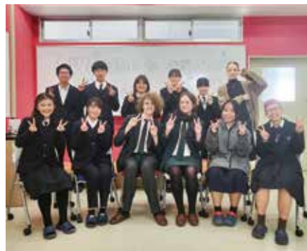
Interaction with High School Students from New Zealand