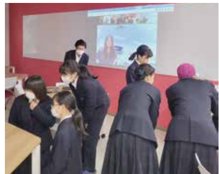
Online Interaction with RMSC High School (Australia) Students